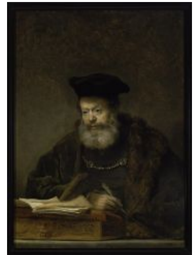
36 x Rembrandt